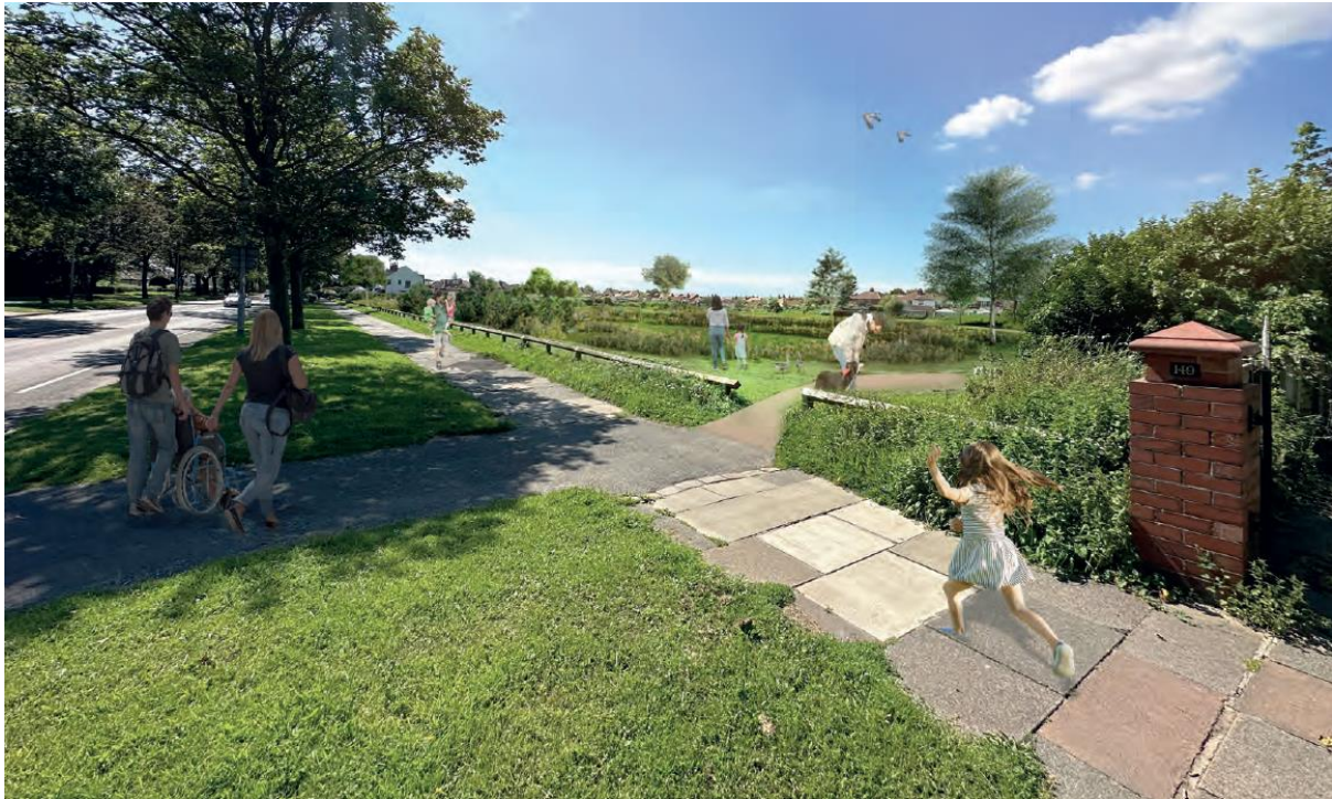
Image showing how the area at Preston New Road could look following the work.

Image showing how the area at Crossens recreation ground could look following the work.