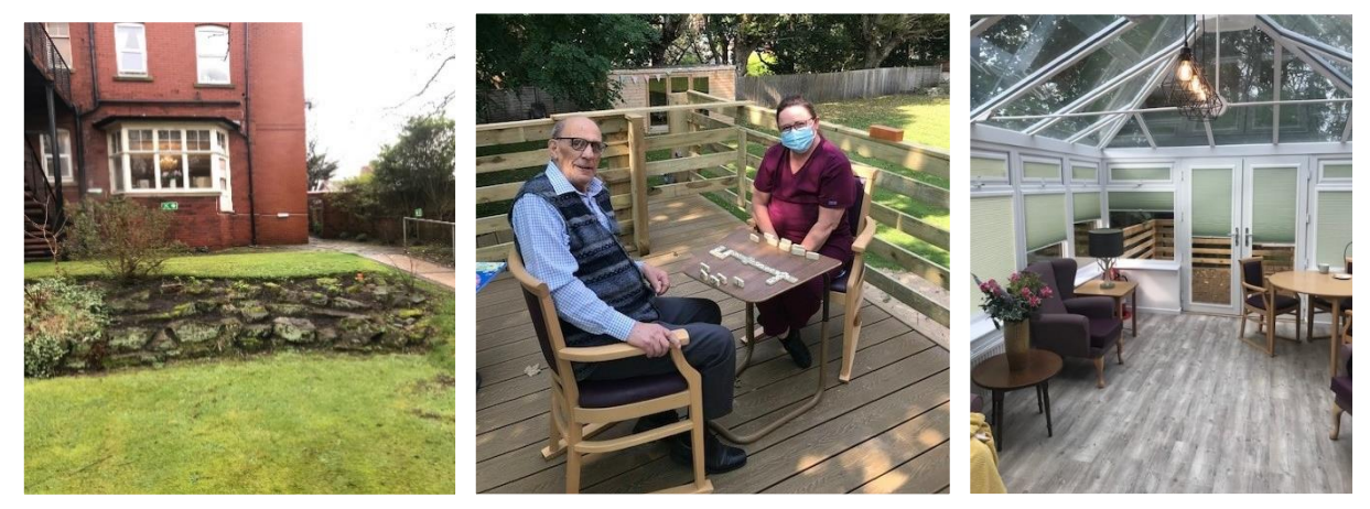
Picture 1 shows the area before the grant, with the following pictures showing the new conservatory.

The Manager presented an album of pictures and events that they have held in the conservatory including Halloween party, Christmas dinner and residents' birthday parties. The album shows the journey from beginning of works to completion. The Home Director shared with us that the residents had been involved in all aspects of project development choosing the décor and the flooring. We spoke to some of the residents sitting in the conservatory during our visit and they told us how happy and pleased they were to be able to enjoy such a lovely, bright space.