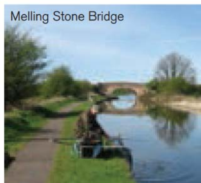
Melling Stone Bridge