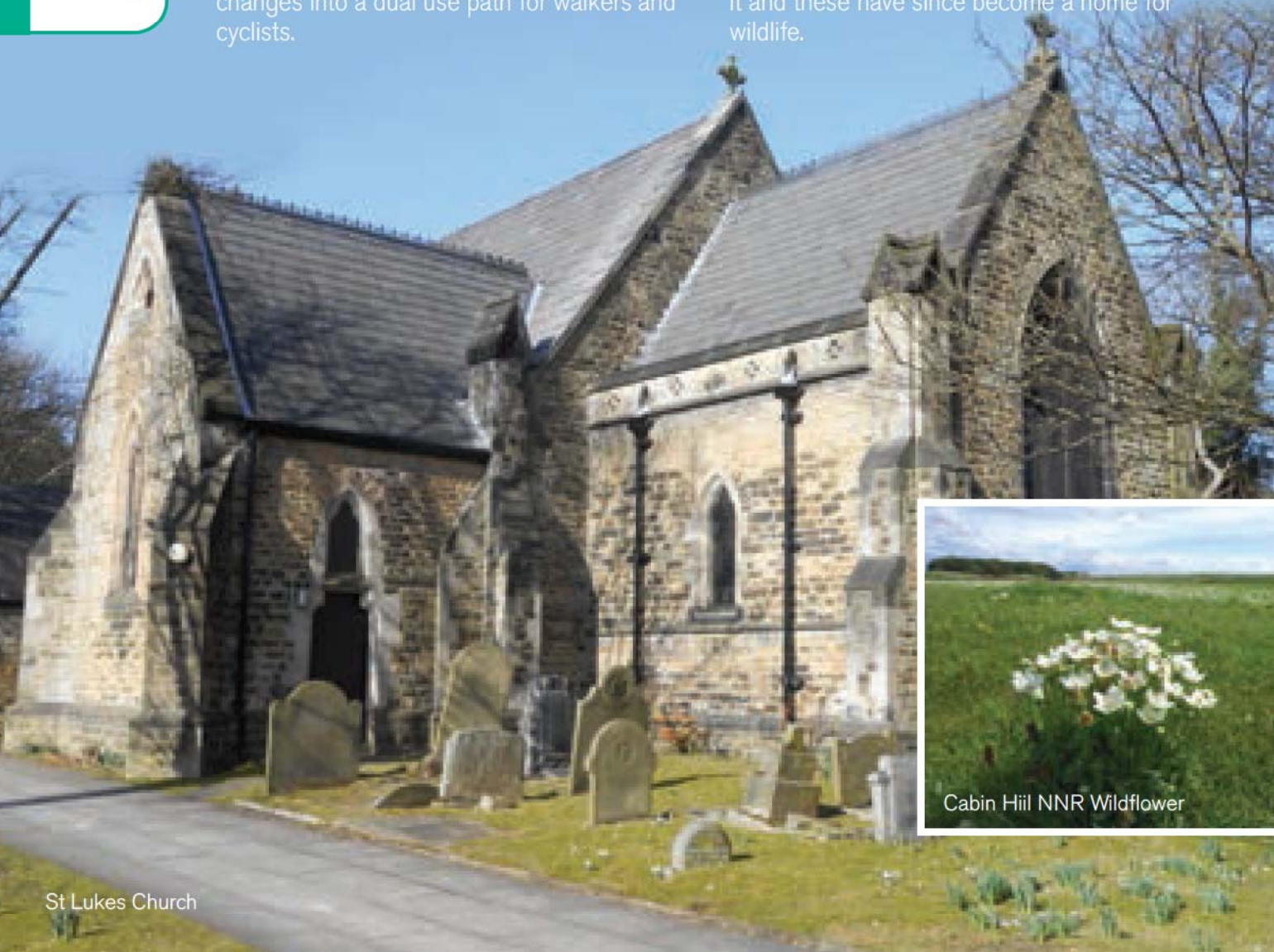
Cabin Hill NNR Wildflower

Continue along the path and look to the right you will see sand dunes and Cabin Hill National Nature Reserve (NNR) in the distance. Cabin Hill was the largest dune on this part of the Sefton Coast, and was used as a landmark by ships approaching Liverpool. The dune was removed by sand extraction which led to the creation of a flood bank in 1970 to protect the low lying land behind the dunes from stormy high tides. The flood bank inadvertently created slacks on either side of it and these have since become a home for wildlife.