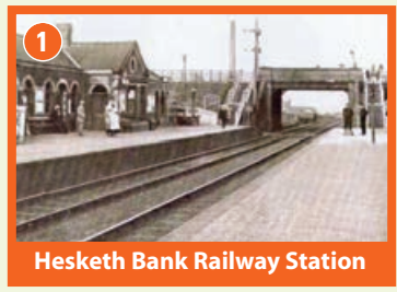
Hesketh Bank Railway Station