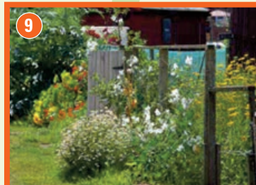
Poor Marsh Allotments