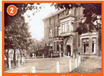
The Beconsall Hotel