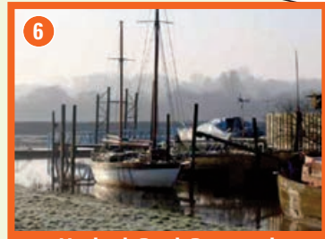
Hesketh Bank Boatyard