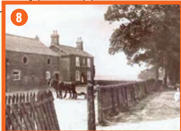
The Hesketh Arms

Start/Finish Booths, Station Road, Hesketh Bank Distance 4 miles Terrain River bank and public footpath