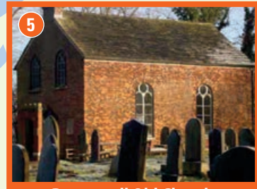
Beconsall Old Church