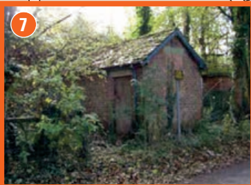
The Dead House