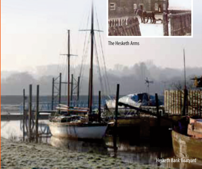
Hesketh Bank Boatyard