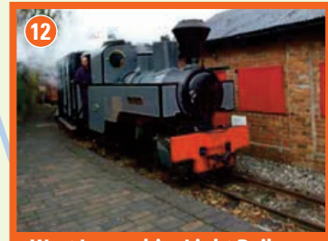
West Lancashire Light Railway