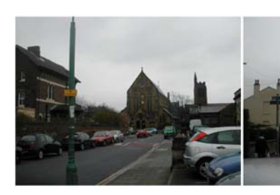
CH Looking south(4)