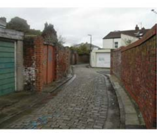
WAL Back alley(2).