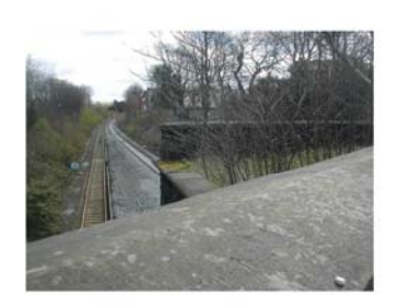
CR Rail arch.JPG