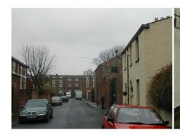
BRM Looking north(3)