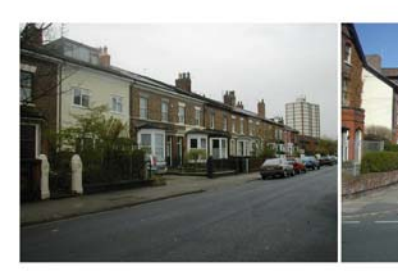
WAT North from Christ Church W