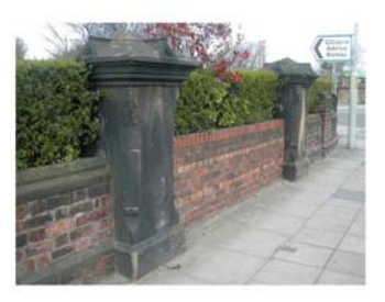
CR Gate pier(2).JPG