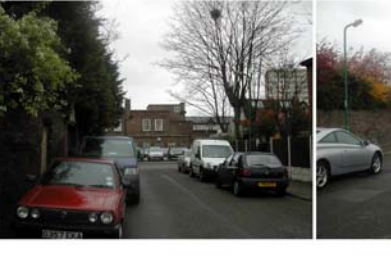
SO Towards Church Rd.