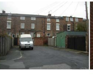
BRM Looking north