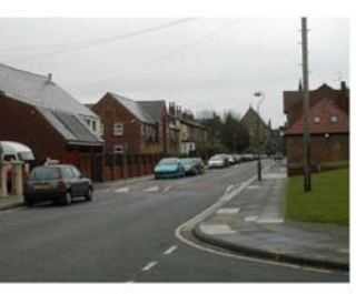
CH Looking south(2)