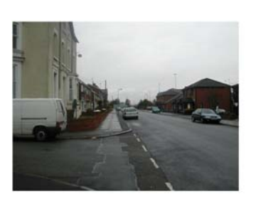
BRP 2Looking south