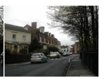
WAL Looking north