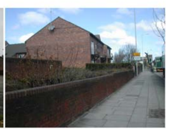
CO Former Coopers Row(3)