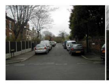
SO1 From Church Rd